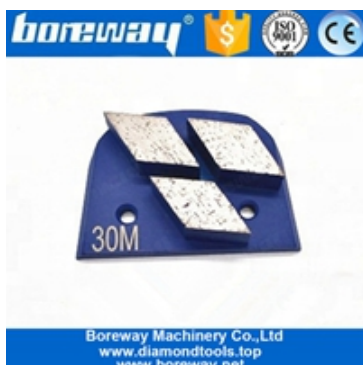
Three segment grinding shoes