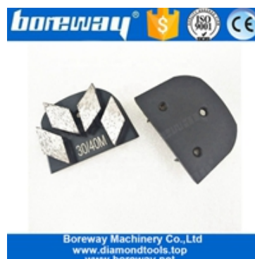
Four Segment Grinding Shoes