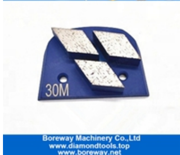
Three segment grinding shoes