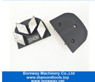
Four Segment Grinding Shoes