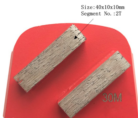
Lavina Concrete Floor Diamond Grinding Plate

If you are interested in our products, you can click on me.