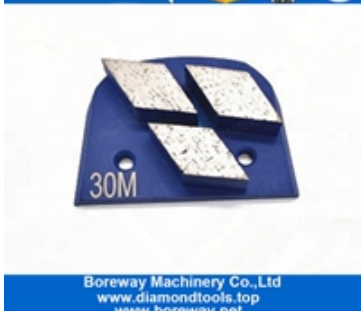
Three Segments Grinding Shoes