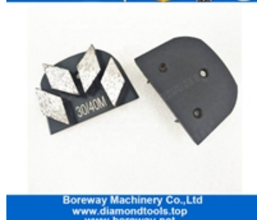
Four Segments Grinding Shoes