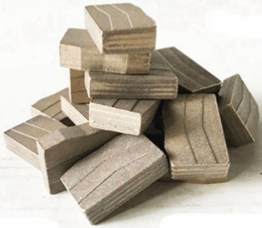
Granite Block Cutting Segment