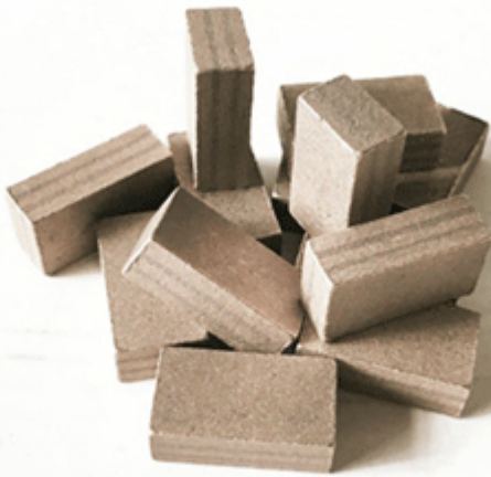
Marble Block Cutting Segment