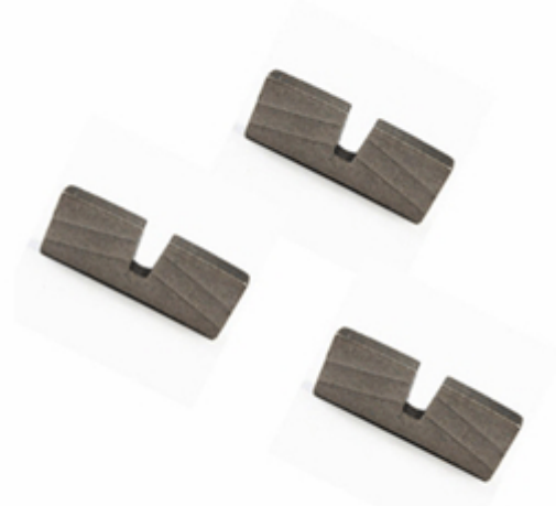
Granite Edge Cutting Segment