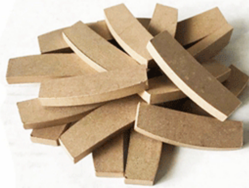
Marble Edge Cutting Segment