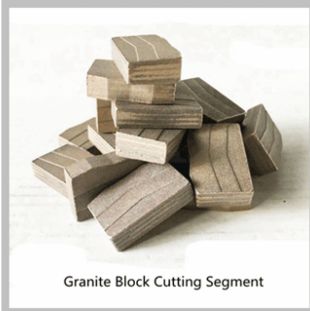
Granite Block Cutting Segment