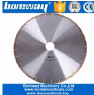
14 Inch Marble Saw Blade