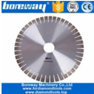
16 Inch Granite Saw Blade