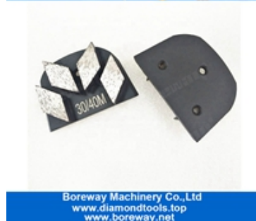
Four Segments Grinding Shoes