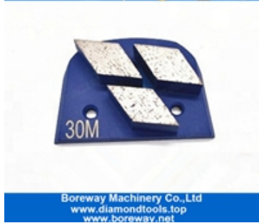
Three Segments Grinding Shoes