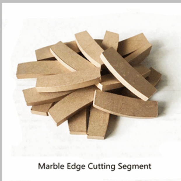
Marble Edge Cutting Segment