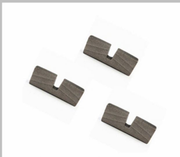
Granite Edge Cutting Segment