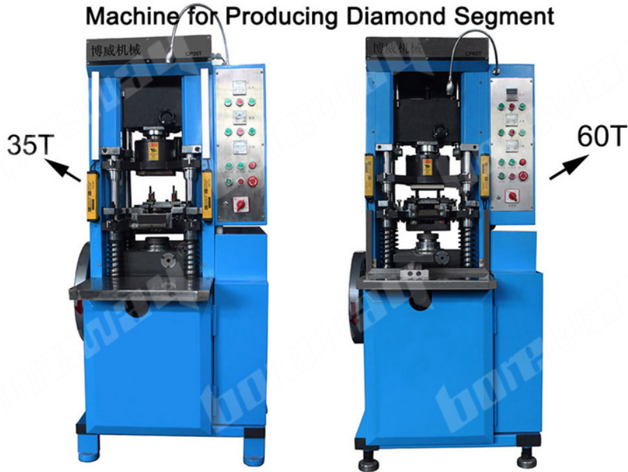
Cold Pressing Machine