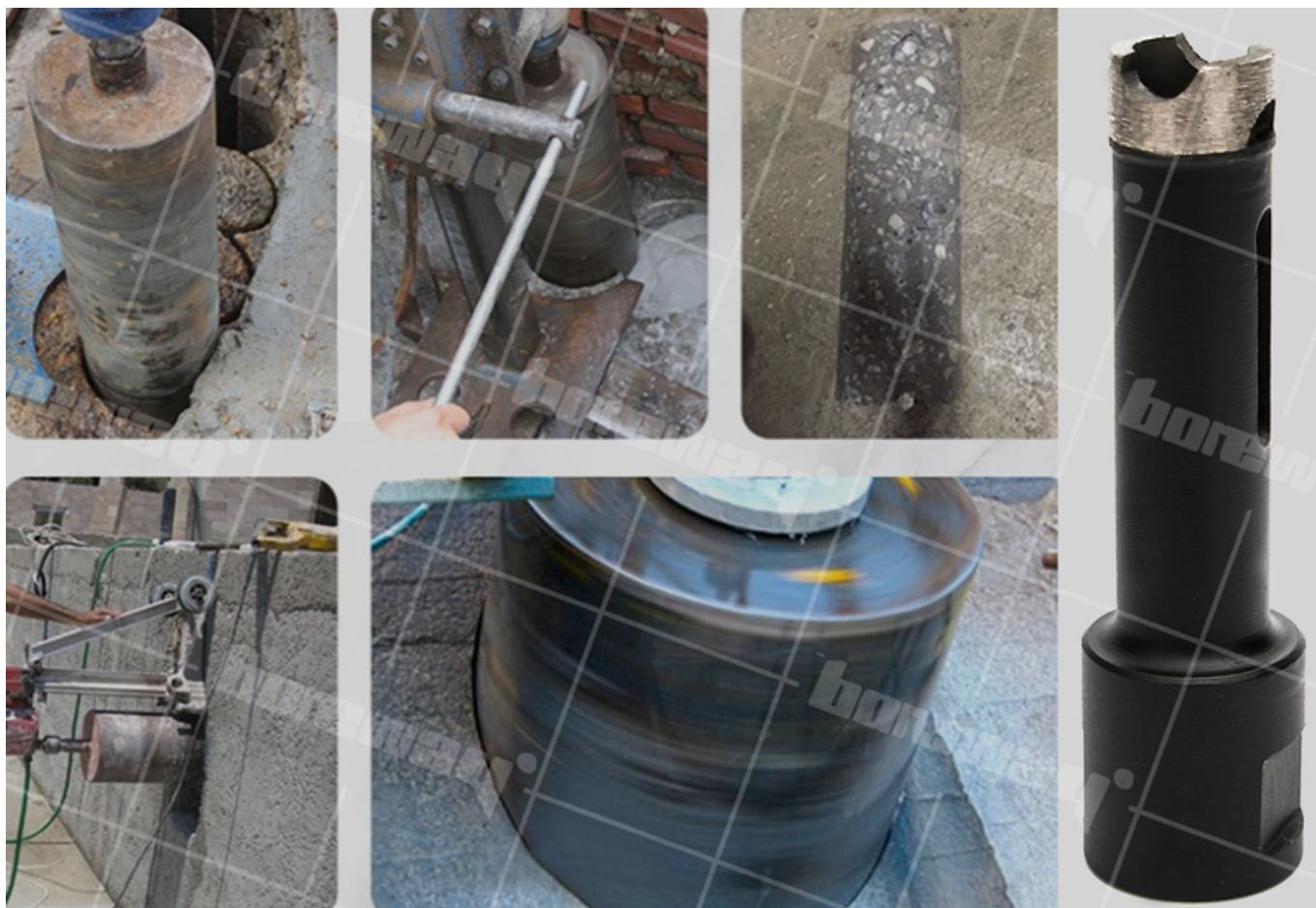
Machine for making cutter Segment: