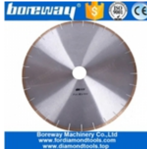
14 Inch Marble Saw Blade