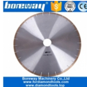
14 Inch Marble Saw Blade