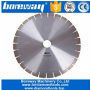
14 Inch Granite Saw Blade