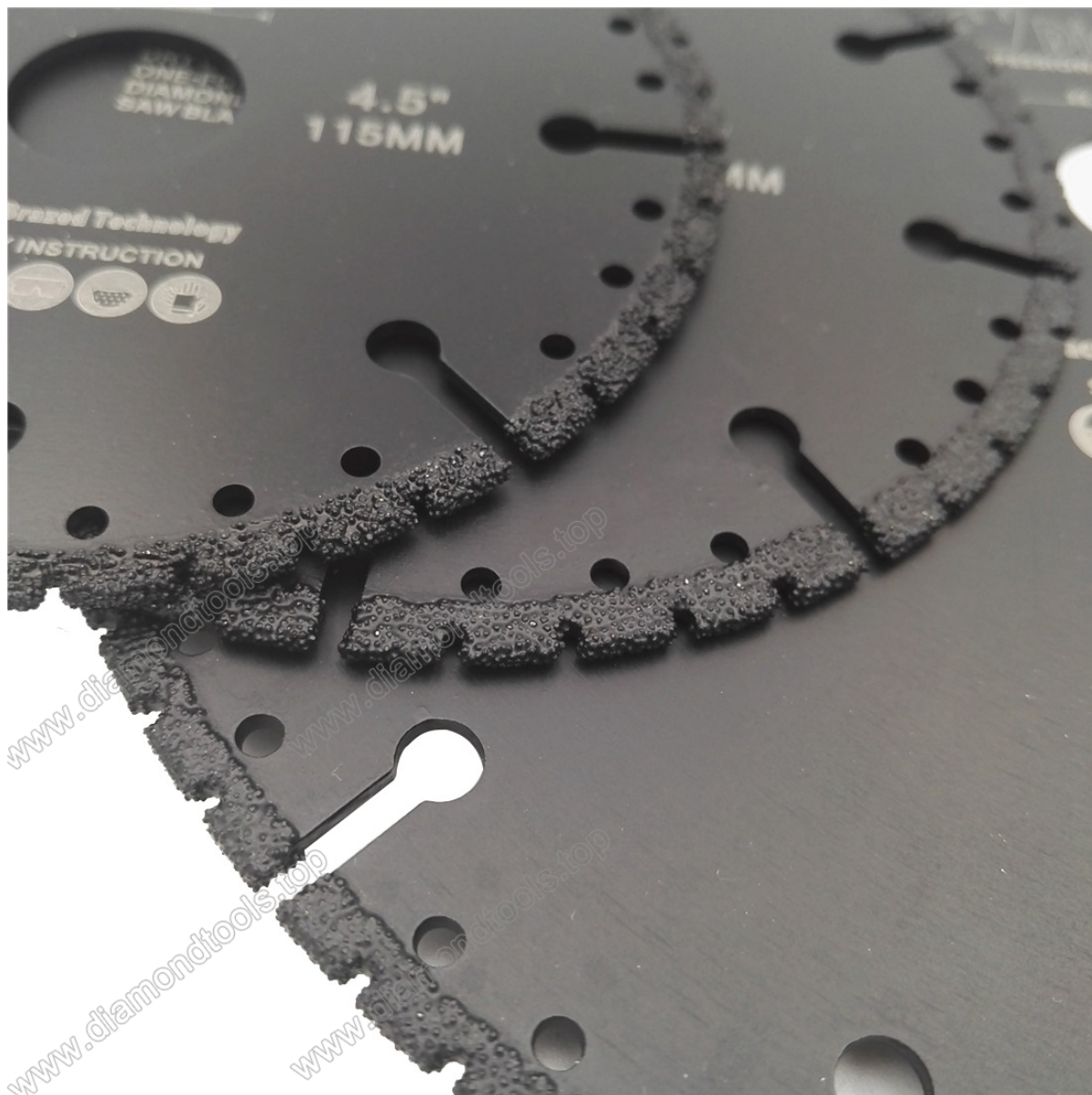
115MM Vacuum Brazed Diamond Blade for All Purpose Demolition Blade