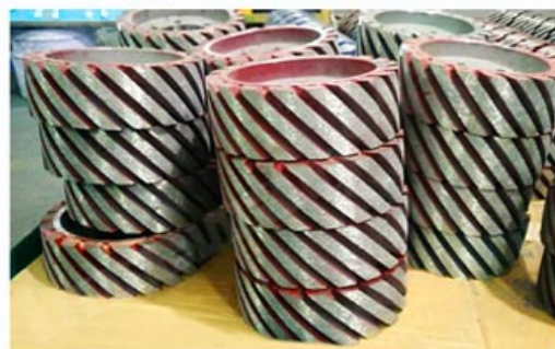
Diamond Satellite Wheel/ Rollers