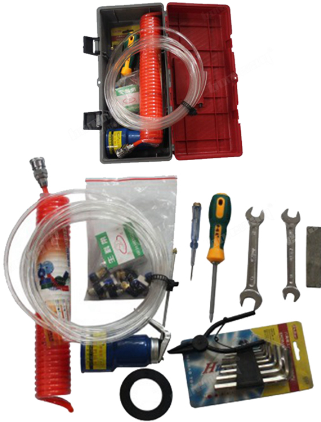
The Packing of Welding Frame Rack For Circle Diamond Saw Blade