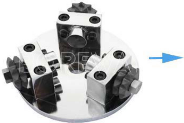
20S Star Bush Hammer Plate