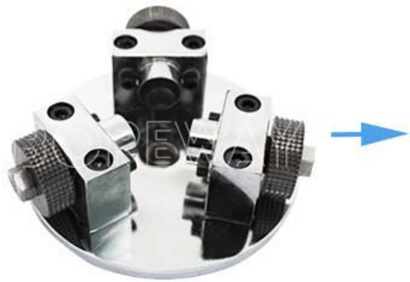
Hundred Teeth Bush Hammer Plate