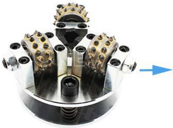
Carbide Alloy Bush Hammer Plate