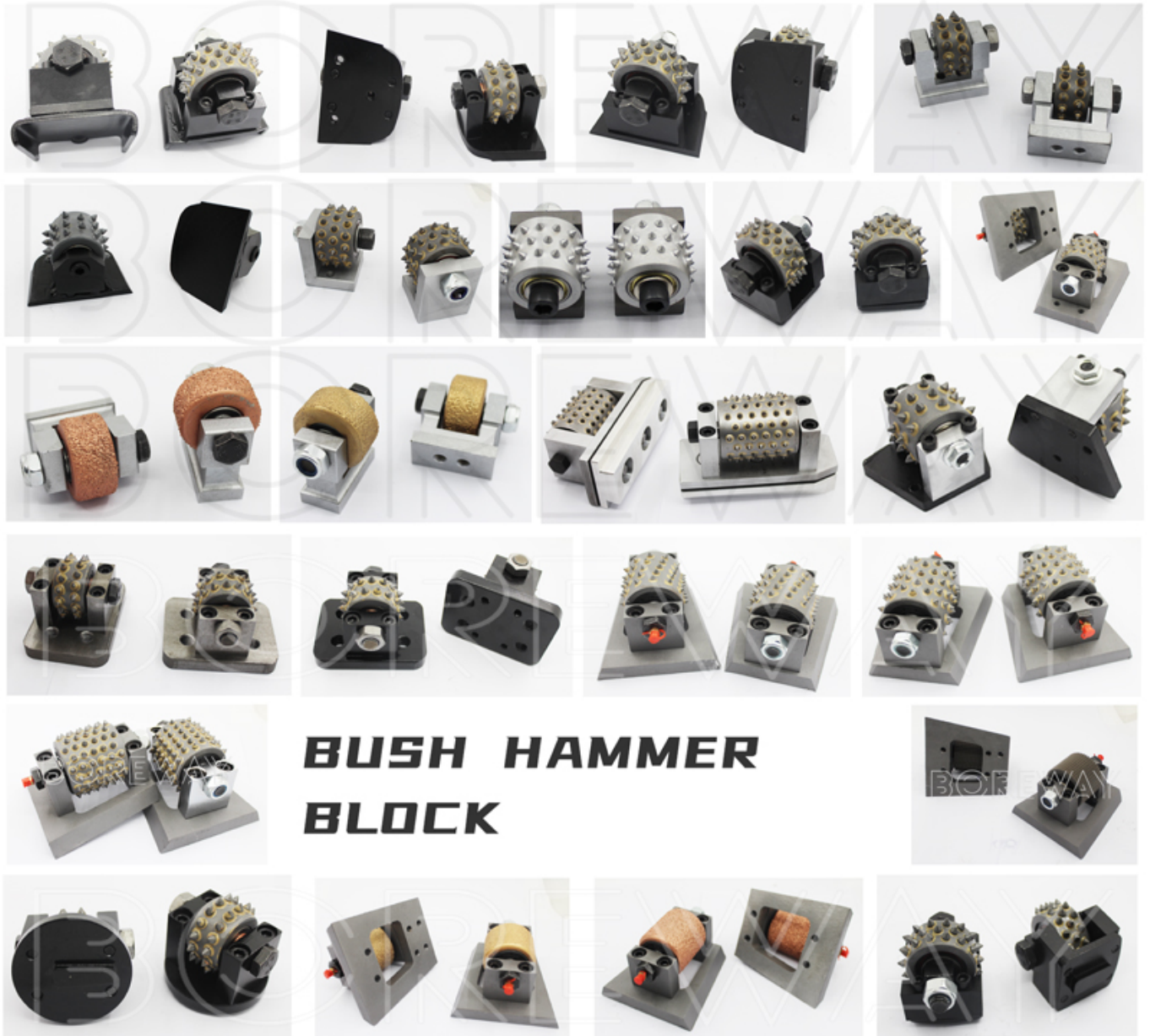
BUSH HAMMER BLOCK