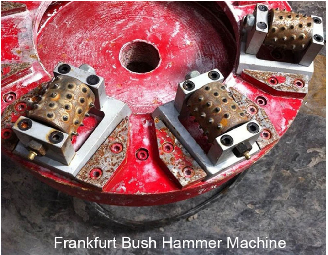
Frankfurt Bush Hammer Machine

6.Machines (Hand Held Grinders, Automatic Bush Hammering Machine, Automatic Grinding Machine, Angle Grinder, And Floor Grinders)