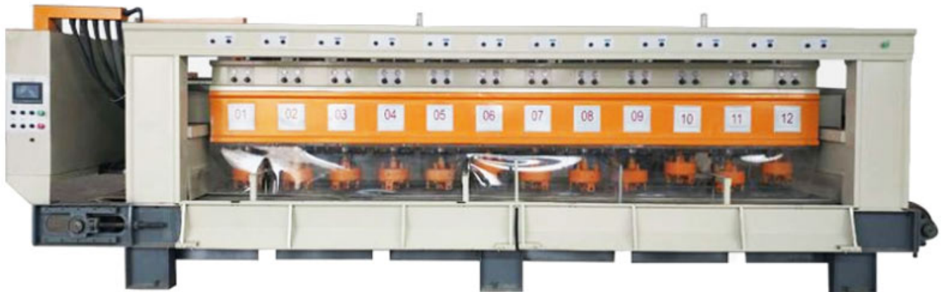
Automatic Bush Hammer Machine