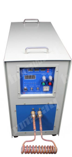
Three Phase 380V 30kW High Frequency Induction Welding Machine