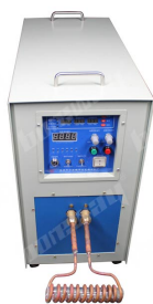
Three Phase 380V 30kW High Frequency Induction Welding Machine