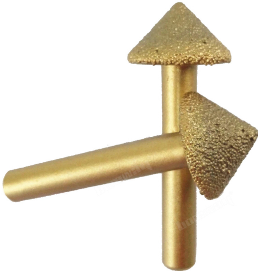
CNC Engraving Bit

Boreway Machinery Co., Ltd. www.diamondtools.top www.boreway.com