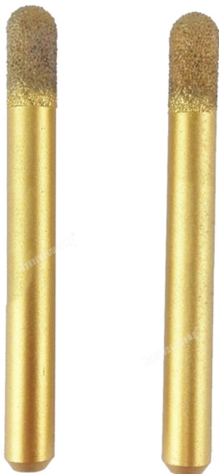
Vaccum Brazed Diamond engraving bit

Boreway Machinery Co., Ltd. www.diamondtools.top www.boreway.com