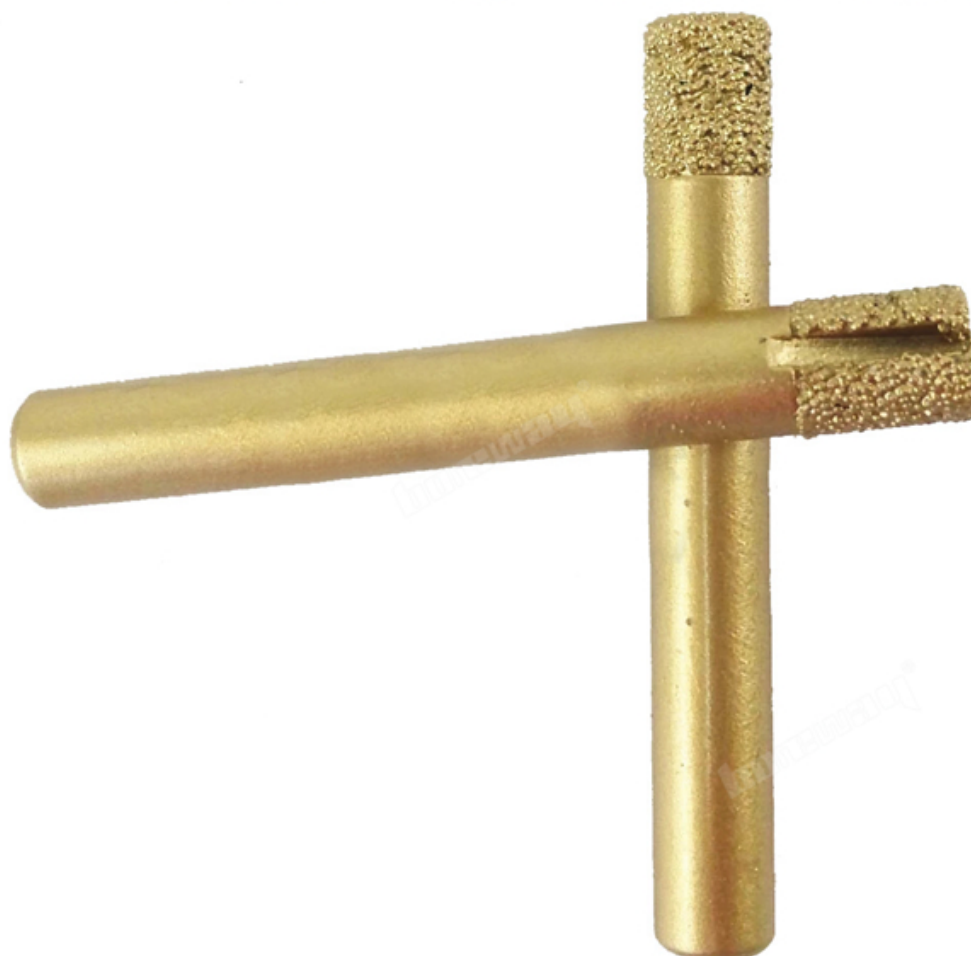
CNC Engraving Bit

Boreway Machinery Co., Ltd. www.diamondtools.top www.boreway.com