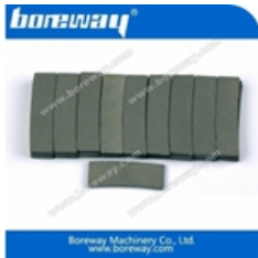
Edge Cutting Segment for Granite