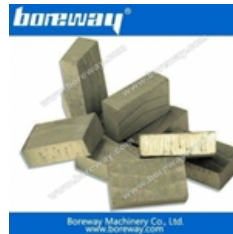
Block Cutting Segment for Marble