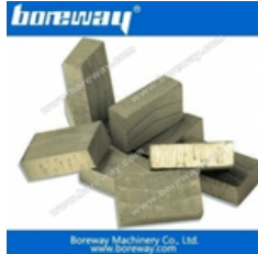
Block Cutting Segment for Marble