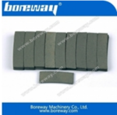
Edge Cutting Segment for Granite