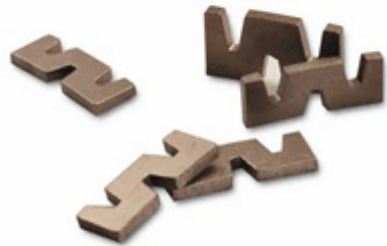
W Shape Edge Segment