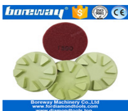
Flower Floor Polishing Pads