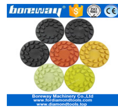
Diamond Floor Polishing Pads