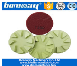
Flower Floor Polishing Pads