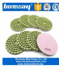
Resin Bond Concrete Floor Pads