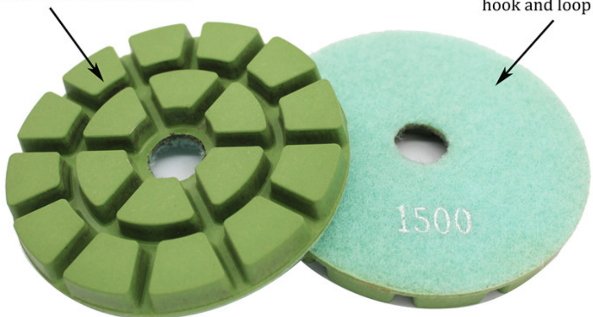
floor renew diamond polishing pads