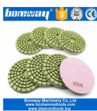
Resin Bond Concrete Floor Pads