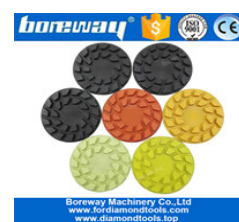
Diamond Floor Polishing Pads