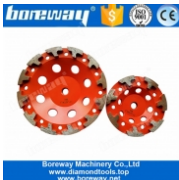
7 Inch "T" Diamond Grinding Cup Wheel