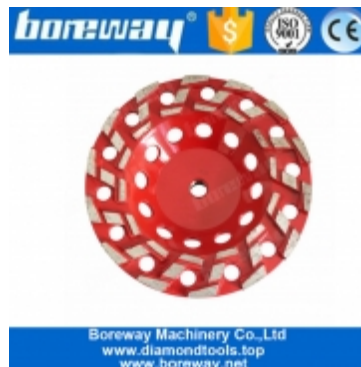
7 Inch "S" Diamond Grinding Plates