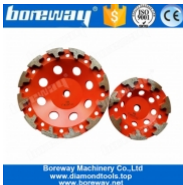
7 Inch "T" Diamond Grinding Plates