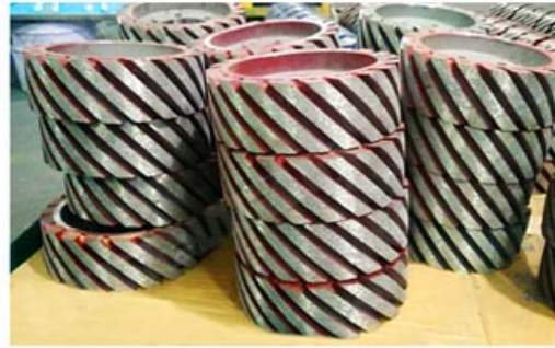
Diamond Satellite Wheel/ Rollers