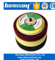
5 Inch Foam Backer Pad