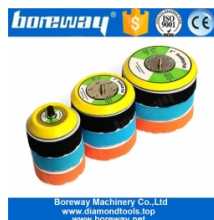
5/16"-24 Thread Backer Pad