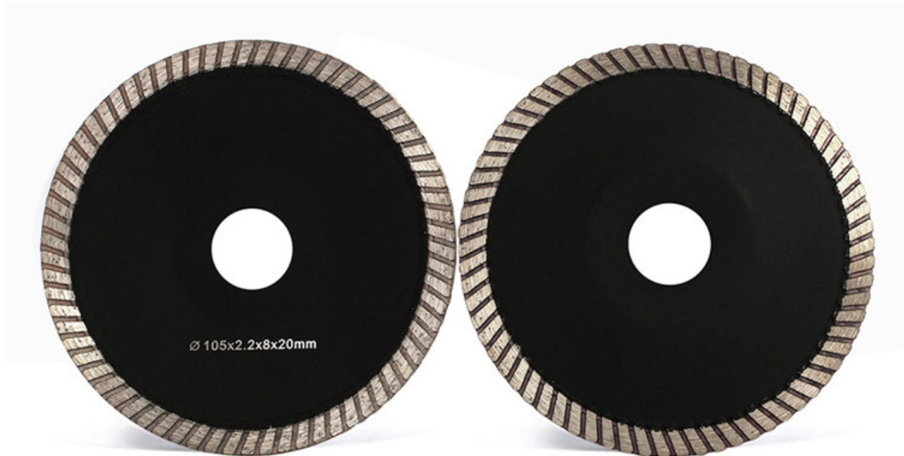
5 Inch Concave Diamond Cutting Blade