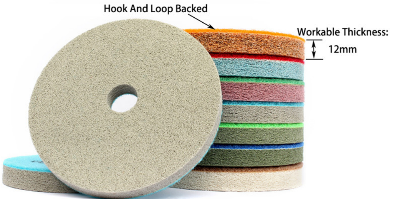
5 Inch 7 Step Sponge Abrasive Polishing Pads For Marble Granite