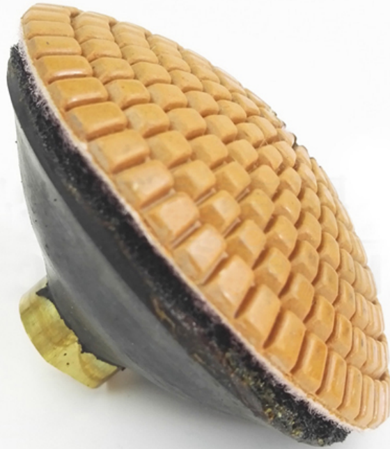
Bowl shaped wet diamond polishing pad

Boreway Machinery Co., Ltd. www.diamondtools.top www.boreway.com