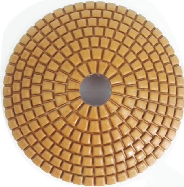
Bowl shaped wet diamond polishing pad

Boreway Machinery Co., Ltd. www.diamondtools.top www.boreway.com