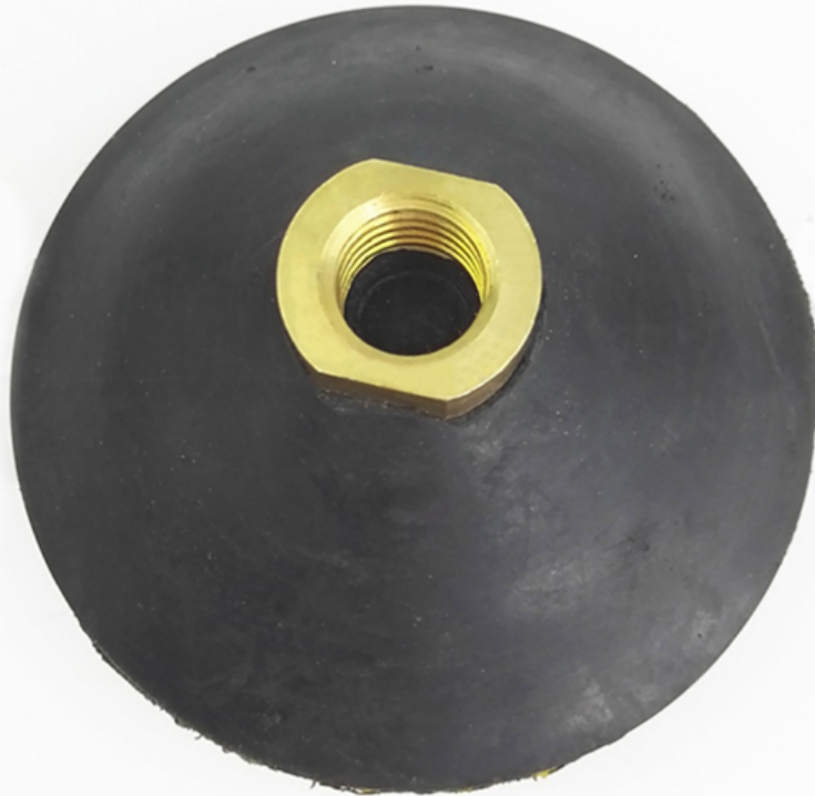
Bowl shaped wet diamond polishing pad

Boreway Machinery Co., Ltd. www.diamondtools.top www.boreway.com