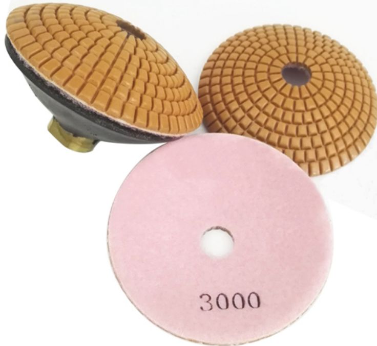
Bowl shaped wet diamond polishing pad

Boreway Machinery Co., Ltd. www.diamondtools.top www.boreway.com