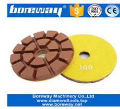
Resin Diamond Floor Polish Pad