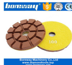
Resin Diamond Floor Polish Pad