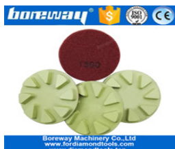
Flower Floor Polishing Pad