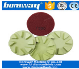
Flower Floor Polishing Pad