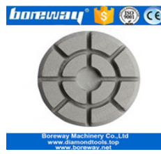
Diamond Floor Renovate Pads