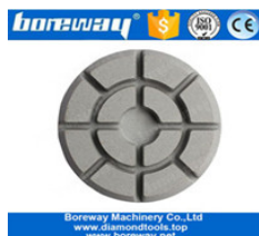
Diamond Floor Renovate Pads