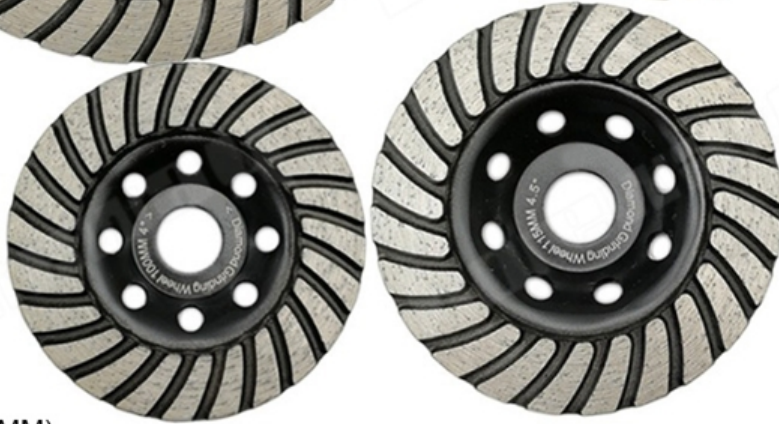
4 Inch (D100MM)