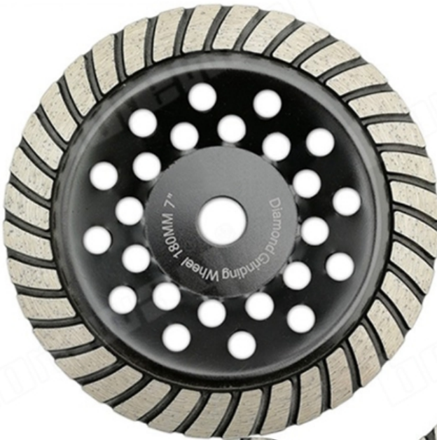
7 Inch (D180MM)