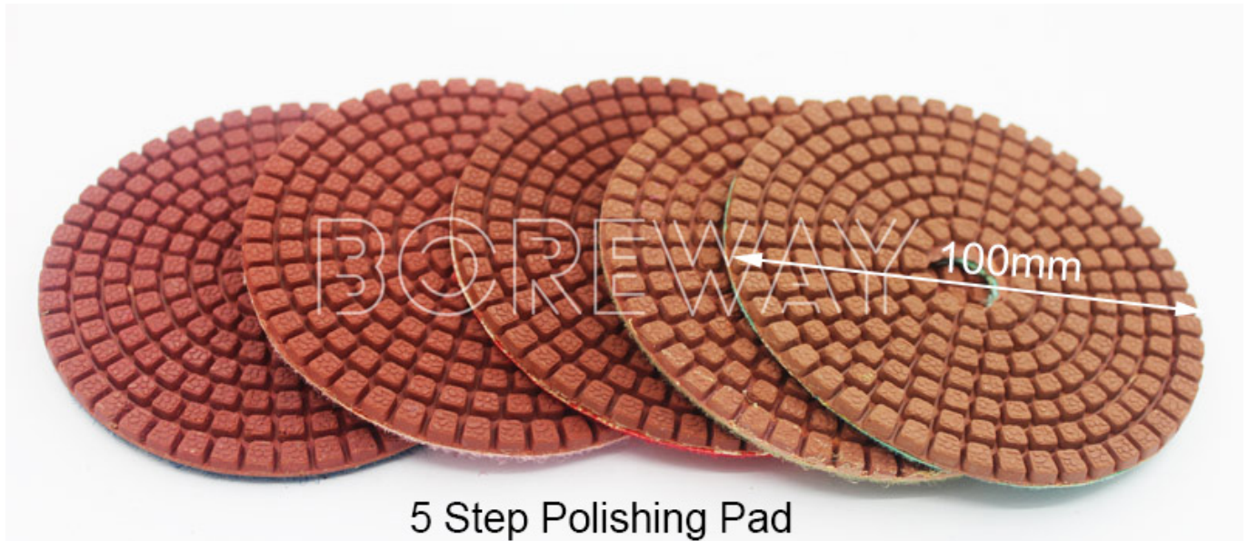
5 Step Polishing Pad