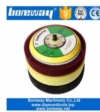
5 Inch Foam Backer Pad