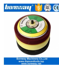
5 Inch Foam Backer Pad