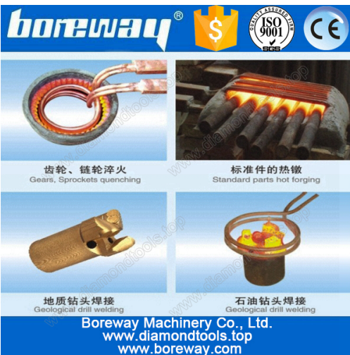
A variety of materials welding

Annex:Foot switch/hand-press switch,heating coil(can be customized),water pipes,water pumps(need to buy).