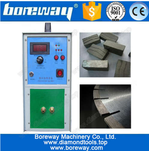
Diamond saw blade welding