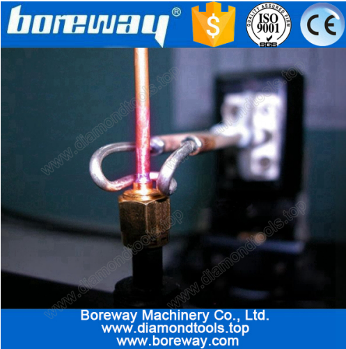
Copper tube welding