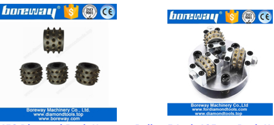
45S Diamond Bush Hammer Roller 5 Inch 125mm Bush Hammered Wheel Plate