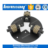
HTC 230MM Bush Hammer Wheel