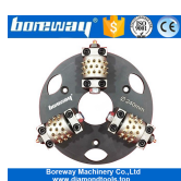
240Mm Buan Hammer For Diamatic Grinder