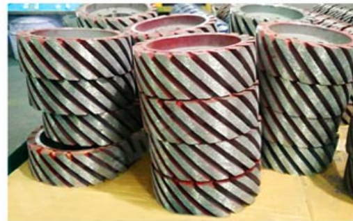
Diamond Satellite Wheel/ Rollers