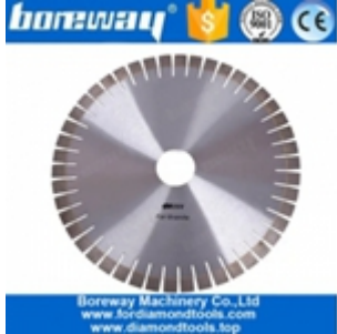
16 Inch Granite Saw Blade