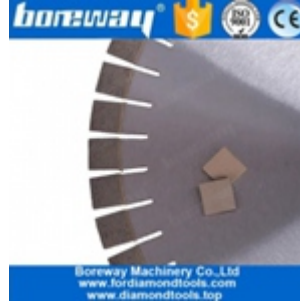
350mm Granite Saw Blade