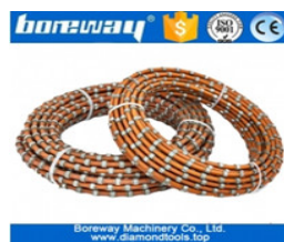
Portable Abrasive Diamond Wire Saw