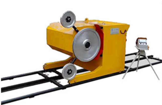
Electric Wire Saw Cutting Machine

11Mm rubber diamond wire saw can be used with diamond wire machine.