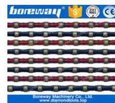
Diamond Saw Hire