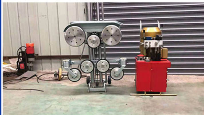
Hydraulic Wire Saw Cutting Machine