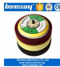
5 Inch Foam Backer Pad