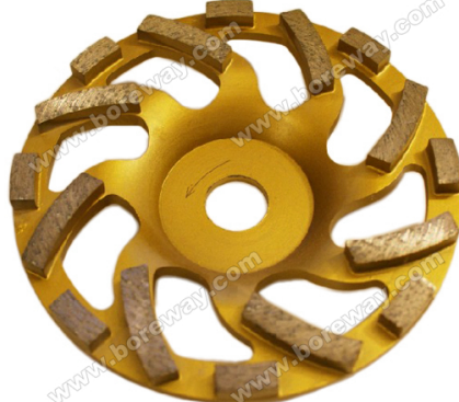
Boreway Machinery Co., Ltd. www.diamondtools.top www.boreway.com