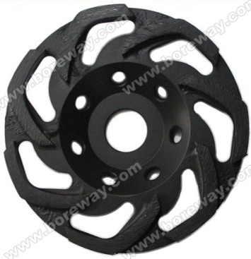
Boreway Machinery Co., Ltd. www.diamondtools.top www.boreway.com