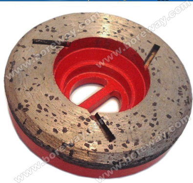
Boreway Machinery Co., Ltd. www.diamondtools.top www.boreway.com