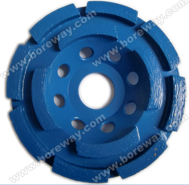
Boreway Machinery Co., Ltd. www.diamondtools.top www.boreway.com