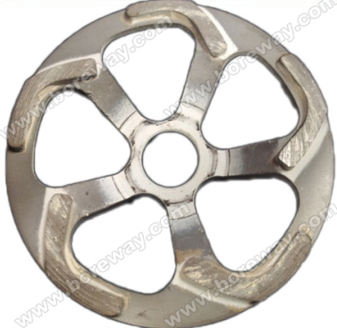
Boreway Machinery Co., Ltd. www.diamondtools.top www.boreway.com