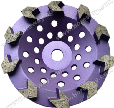
Boreway Machinery Co., Ltd. www.diamondtools.top www.boreway.com