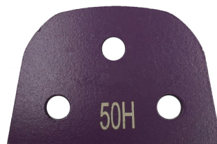
Lavina Blank with 3 Bare Holes