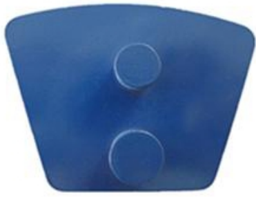
Two Round Pins Redi Lock Blank