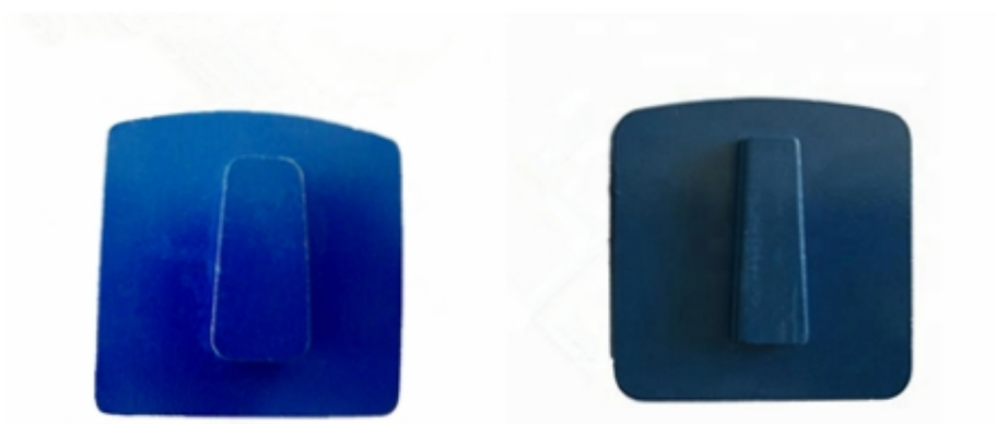
Husqvarna Redi Lock Blank Scanmaskin Blank