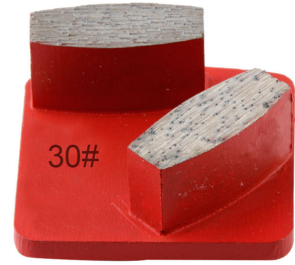
Boreway Machinery Co.,Ltd www.diamondtools.top www.boreway.net