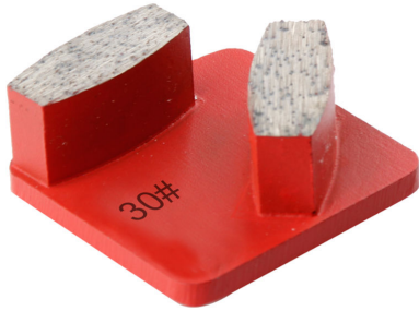
Boreway Machinery Co.,Ltd www.diamondtools.top www.boreway.net