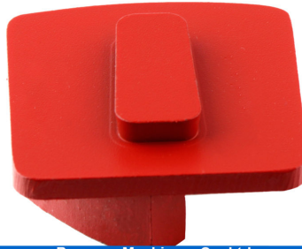
Boreway Machinery Co.,Ltd www.diamondtools.top www.boreway.net