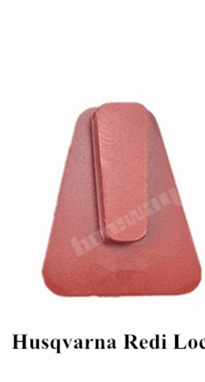
Husqvarna Redi Lock Blank