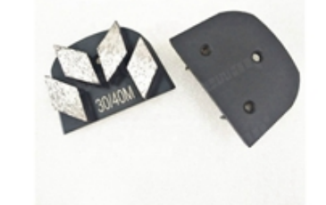
Boreway Machinery Co.,Ltd www.diamondtools.top www.boreway.net