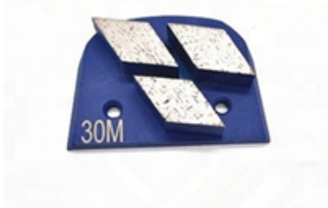
Boreway Machinery Co.,Ltd www.diamondtools.top www.boreway.net