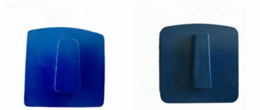
Husqvarna Redi Lock Blank Scanmaskin Blank

Husqvarna Redi Lock Blank, Husqvarna Scanmaskin Blank. Scanmaskin Redi Lock Blank, Scanmaskin Husqvarna Blank.