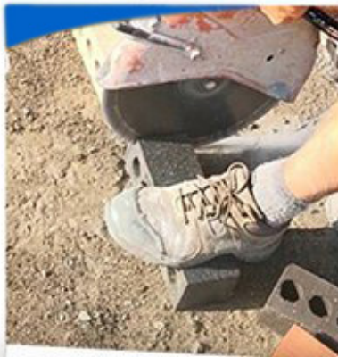
Hard Masonry Block