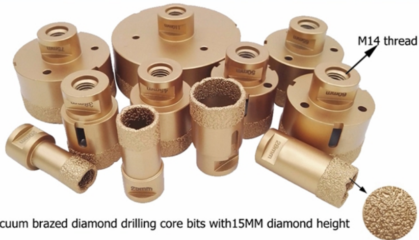
Vacuum brazed diamond drilling core bits with 15MM diamond height

Diameter 20mm, 25mm, 28mm, 30mm, 32mm, 35mm, 38mm; 43mm, 45mm, 50mm, 55mm, 60mm, 65mm, 68mm; 70mm, 75mm, 80mm, 90mm, 100mm, 110mm, 115mm, 125mm