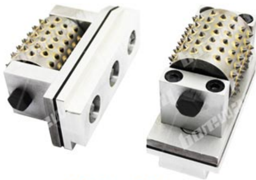
99S Fickert Block

99 □□□□□□ □□ □□ □□ Fickert/Frankfurt Shape Block, Bush Hammer Plate.