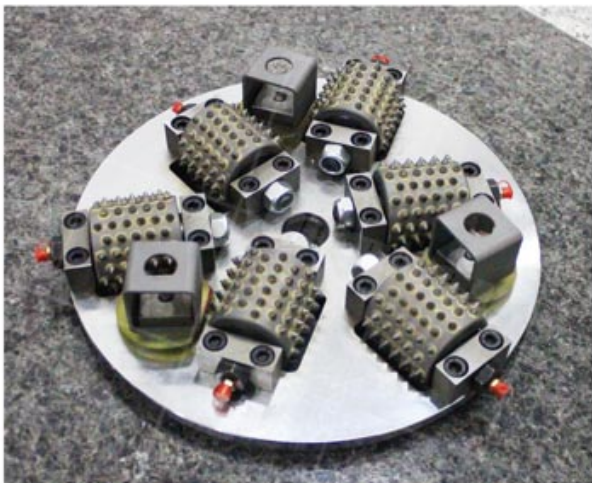
D300x6Tx99S Sinking Grinding Disc