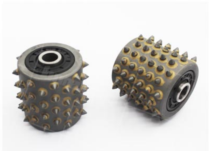
99S Bush Hammer