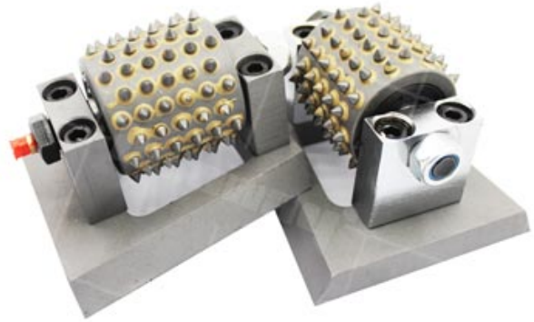
99S Frankfurt Block