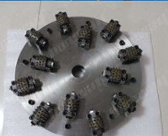
Boreway Machinery Co., Ltd www.diamondtools.top www.boreway.com