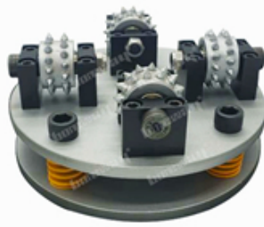
Boreway Machinery Co., Ltd www.fordiamondtools.com www.diamondtools.top